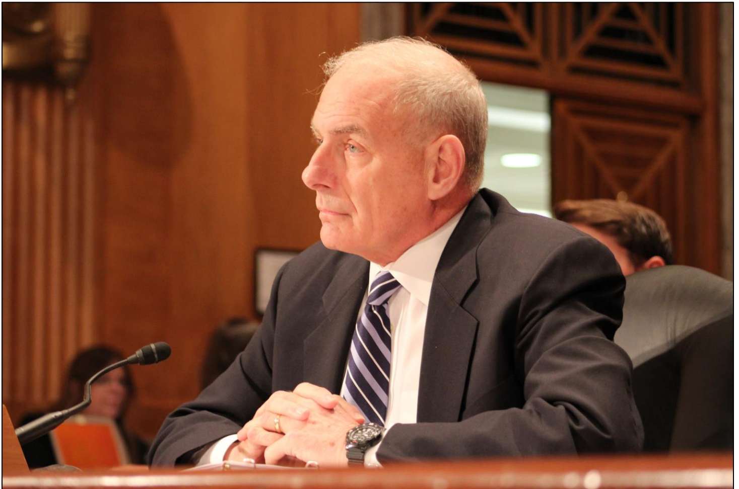
PHOTO: Secretary Kelly testifies before Senate Homeland Security & Governmental Affairs Committee

“There’s no way I can give the committee an estimate of how much this will cost. I mean, I don’t know what it will be made of, I don’t know how high it will be, I don’t know if it’s going to have solar panels on each side and what the one side’s going to look like and how it’s going to be painted -- have no idea. So I can’t give you any type of an estimate.” 3